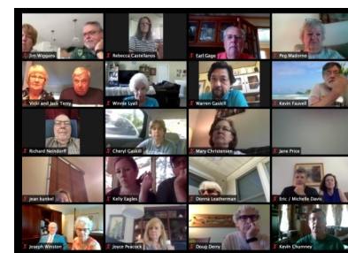
On the Zoom call, there were over 100 members (4 screens!) who were joyous to all “be together”